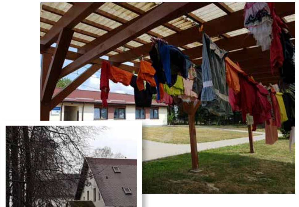
Rebuilding and also new houses for more children, at the moment 50.

children from families who suffer various difficulties most of which are alcohol abuse, psychological or physical violence. By the side if the children's home is the church that is built in stone. During the Russian occupation, the church was used as sports hall for soldiers but now renovated and serving as a church again. The vice Chancellor have visited the Orphanage several times.