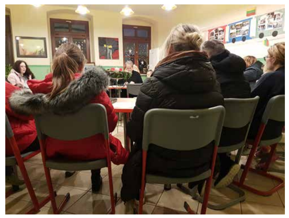
All children meet with Priest and staff daily for short Bible studies and discussion.

The daily activities and thoughts are forwarded to the goals that children and people with disabilities stay happy in the orphanage. They are sincerely happy and thankful that the help of our Order supports their dreams to become reality. It is unspeakably important and unmeasurable. To all OCM members they express their sincere thankfulness for the manifold support to their parish.