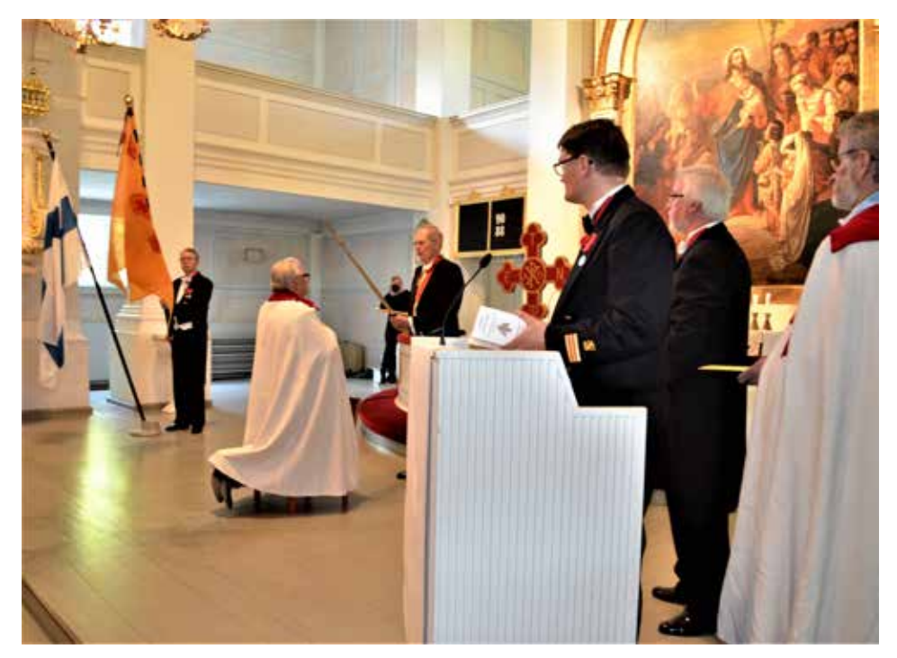
Master of the Order dubbed the new knights in the traditional way.