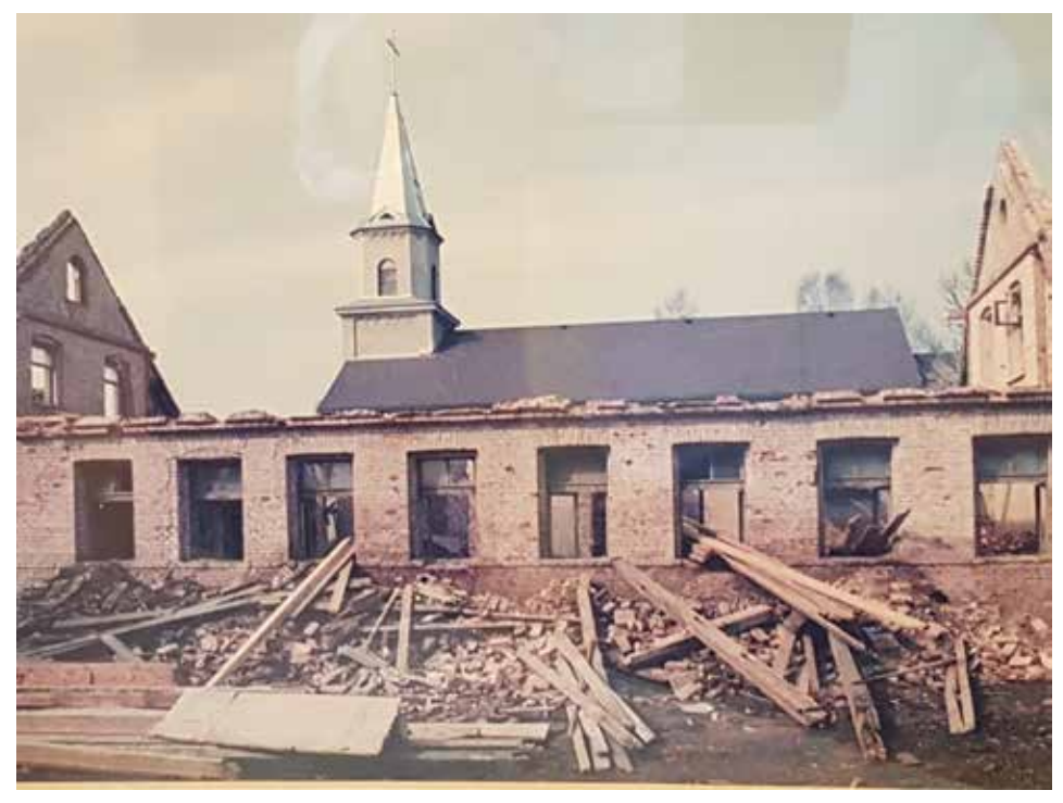
The place was earlier used by Russian troops.