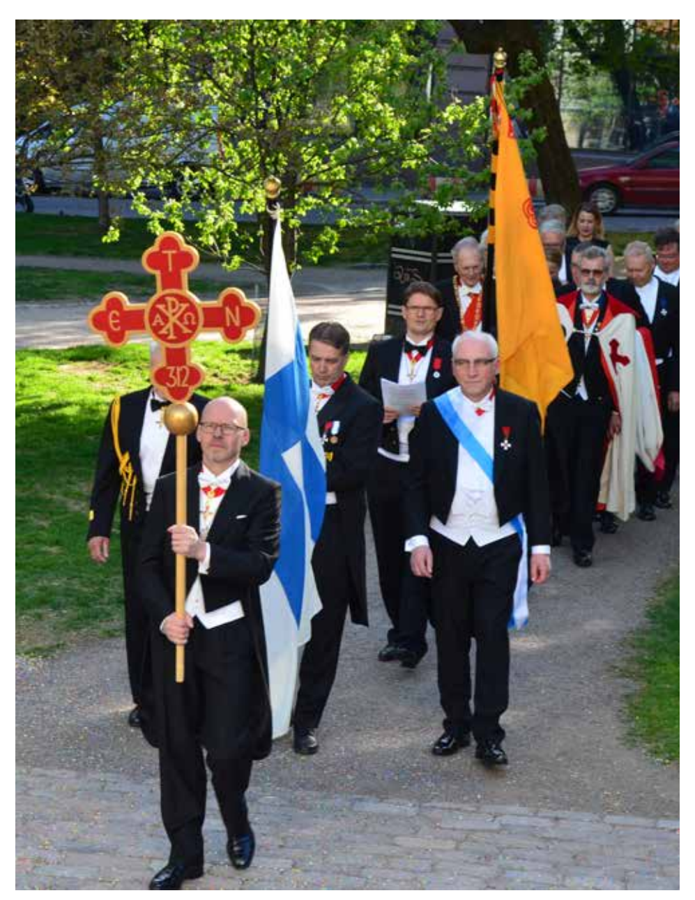
The procession of the Investiture arrives to the lutheran Old Church of Helsinki.