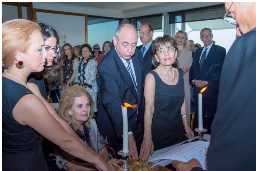
The five new members of the Order, giving their oath