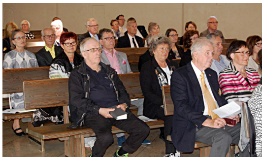
Participants in Resurrection Chapel

After the Service all the participants of the Convention enjoyed a cup of coffee in front of the Chapel, served by local Soldiers' Canteen Society. The sunny weather we had enjoyed the whole weekend saw the radiant knights and their spouses off. Next year we shall meet in Helsinki.