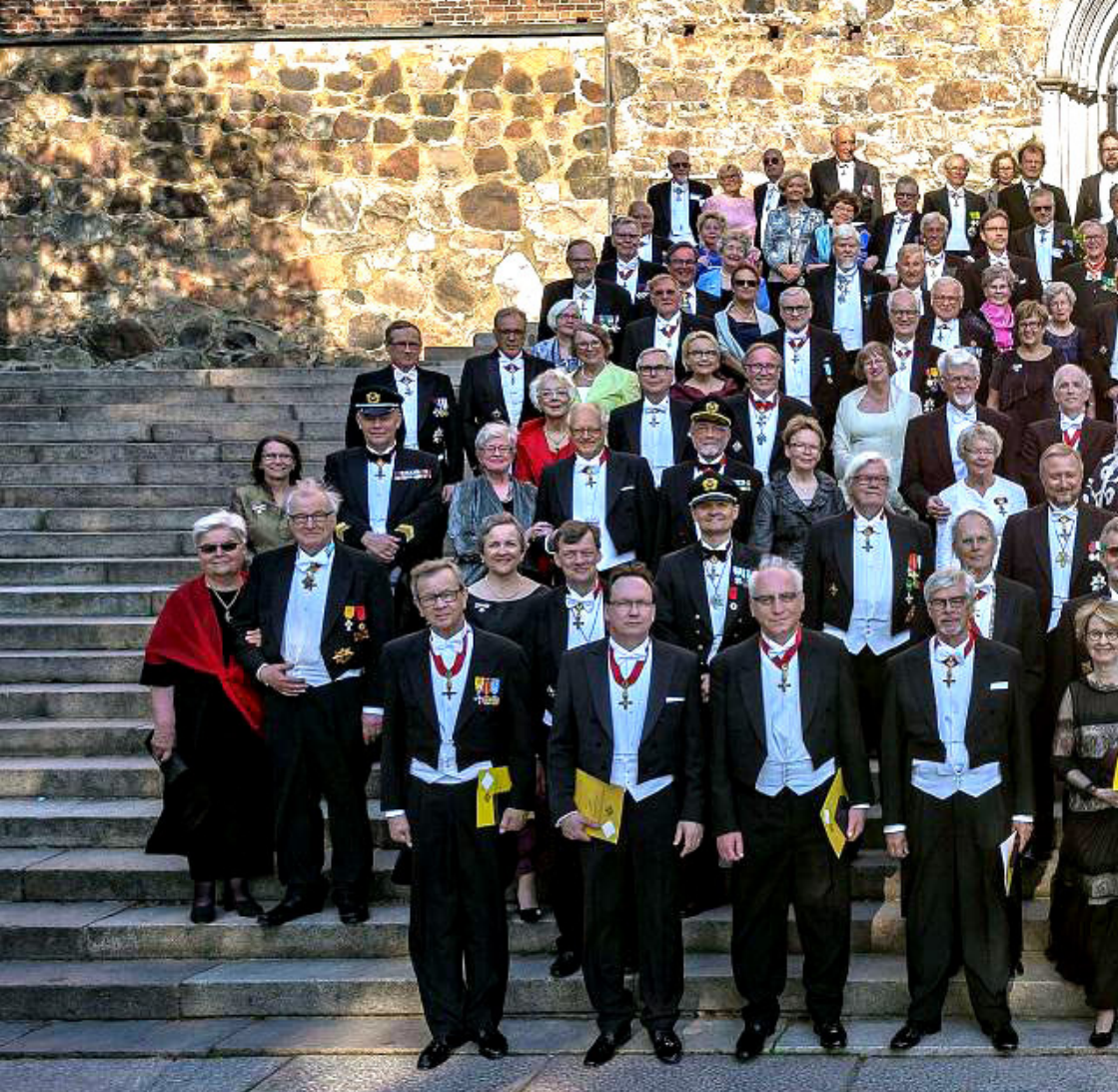
Participants in group foto in Turku Cathedral stairs