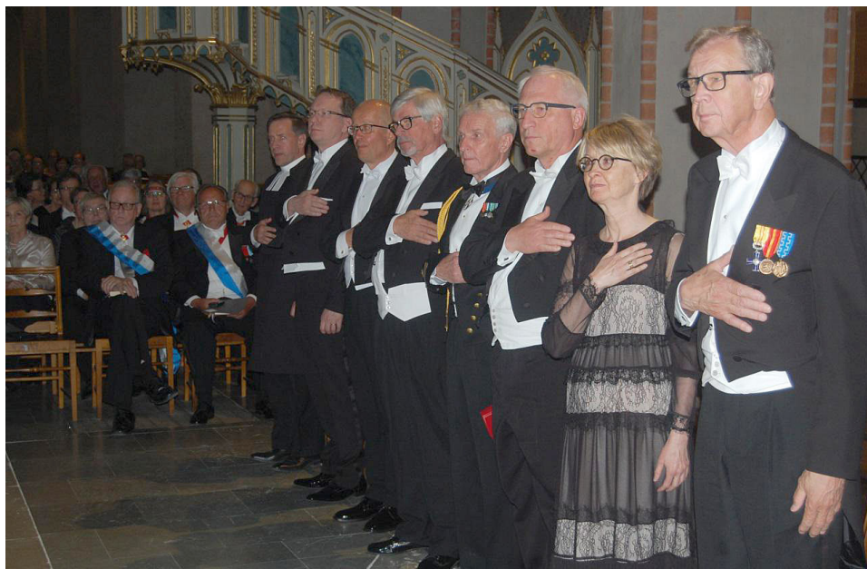
Oath of aspirants