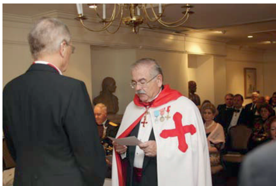
The Master receives the Exarch's Vow.