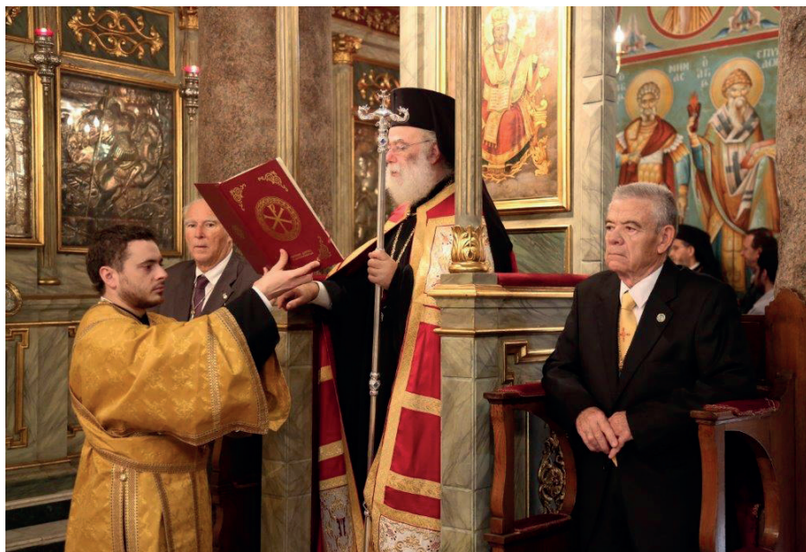
Liturgy in the Patriarchic Church of St Savas