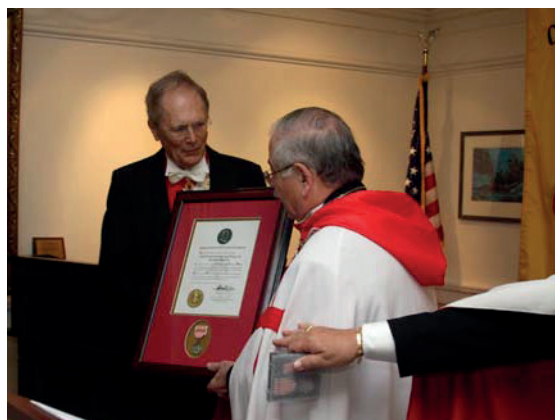
The Exarch of the USA presents the Distinguished Service Medal to the Master.

America with his badge of office and congratulated him for assuming this position within the Order.