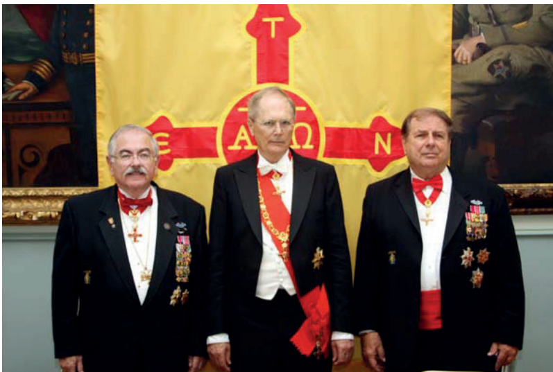
The Exarch, Master, and Vice-Exarch pose in front of the newly acquired OCM Banner for a formal portrait.

their guests begin to find their appropriate tables and await the call to be seated.