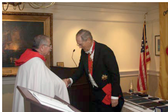
The Master congratulates the Exarch.