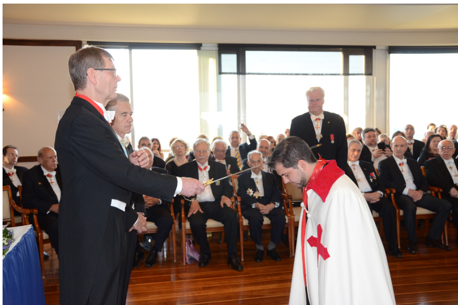
The dubbing ceremony, Chancellor Salmi.

The investiture in presence of the General Patriarchal Vicar, His Eminence Petros Metropolitan of Axum, was chaired by the Exarch, conducted by the Master of Ceremonies Panayotis Chalikias. The Chancellor dubbed