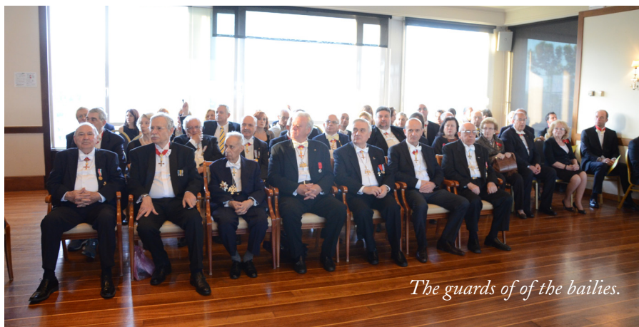
The guards of of the bailies.