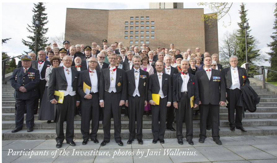
Participants of the Investiture