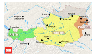
Underlying logic of Bailiwicks: Former roman provinces in todays Austria