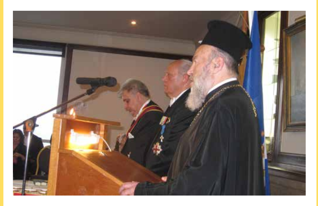
His Em. Petros, during the investiture ceremony of the Hellenic Exarchate in 2010 and 2014.