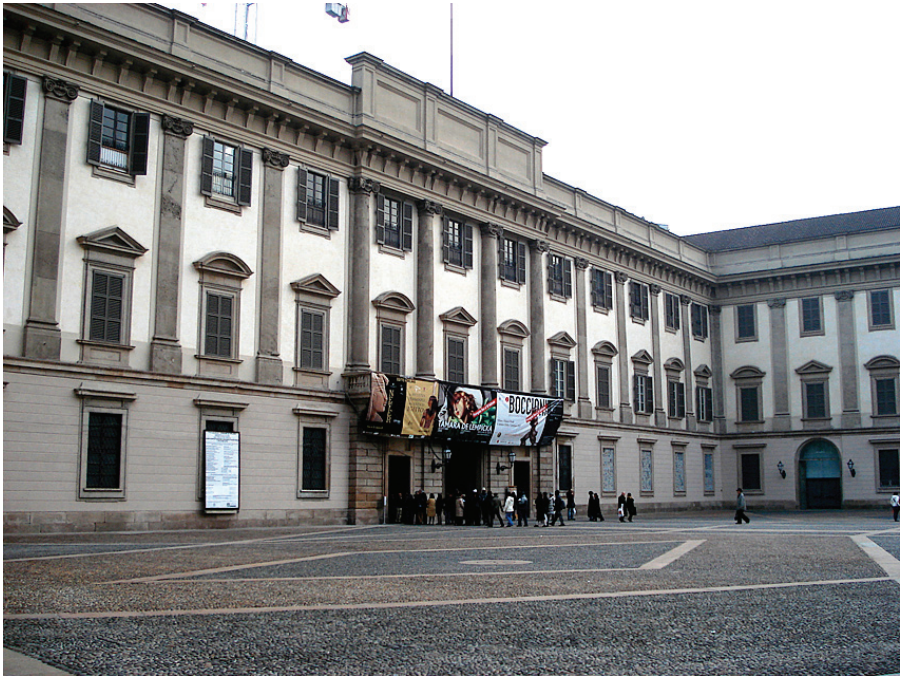
Palazzo Reale, Milan

On this occasion an excellent 1700-years anniversary exhibition of the Edict of Milan is shown at the Palazzo Reale in Milan/Italy from 25th October 2012 until 17th March 2013.