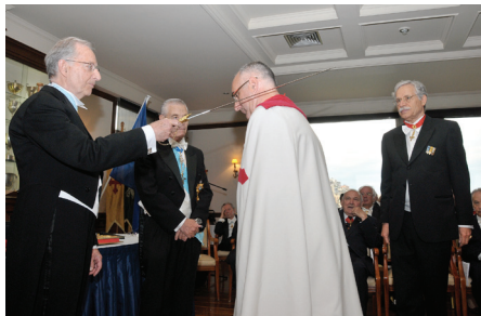
The dubbing ceremony.