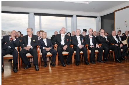
The guards of the bailies.