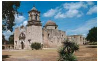
The Alamo in San Antonio, Texas.