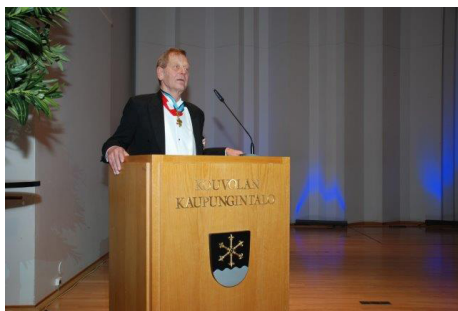
The Chancellor speaks at the gala dinner.