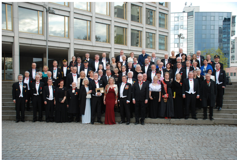
Participants of the Knights' Day in a joint photo in front of Kouvola City Hall.