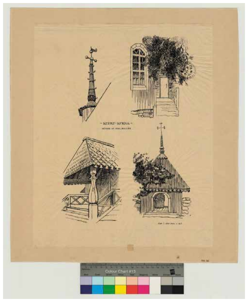
Dimensional drawings on Keuruu Old Church by G. Juslén in 1913–1914. Four original sketches by Axel Gallen-Kallela: Top of Belfry, Door of Sacristy, Southern Entrance & Gateway.