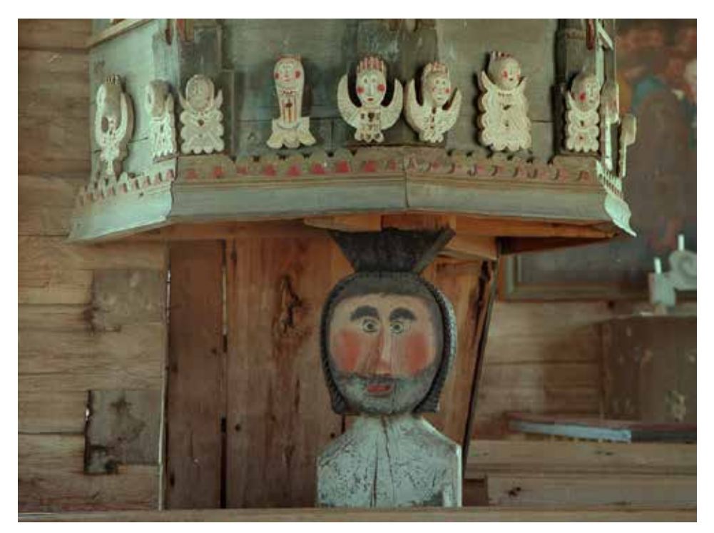
Decoration of the pulpit with human characters in the in Petäjävesi Old Church.

Throughout the 1990s and 2000s, the renovation of the Church continued, partly with national and partly European Union support. In 2005, an indicative management plan was