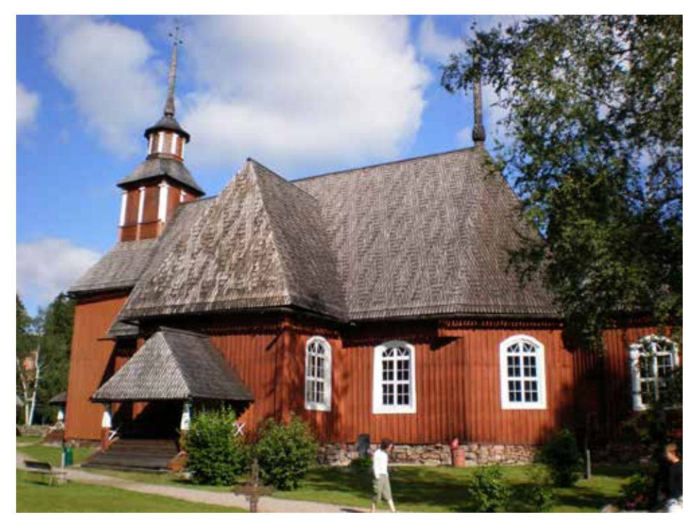
Completed in 1758 and referred as the Picture Church, Keuruu Old Church in is the oldest preserved church building in Central Finland. The paintings in the Church represent faith and hope, the ideals of 18th century.

Some of the churches are pretty well preserved in their original outfits, but others only have log walls covered with newer board lining, and almost no original is visible anymore.