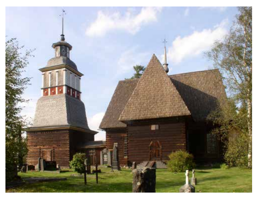
Built in 1763–1765, Petäjävesi Old Church has been on the UNESCO World Heritage Site List since 1994. The belfry was completed in 1831. In the church, European construction styles are combined with peasant building tradition.

In Central Finland, a set of three old wooden churches stand at a distance of some 20 kilometres from each other. They are regarded as the gems of the 18th century Finnish rustic church architecture. Built in 1763-1765, Petäjävesi Old Church has been on the UNESCO World Heritage Site List since 1994. In the Church, European construction styles are combined with peasant building tradition. Completed in 1758 and referred as the Picture Church, Keuruu Old Church in is the oldest preserved church building in Central Finland. The paintings in the Church represent faith and hope, the ideals of 18th century. Pihlajavesi Old Church was built in 1780. The atmospheric Church rose to the lap of the forest with the help of a small number of parishioners. Sooty and wet clothes of the church people have created ghostly figures on the walls of the Church.