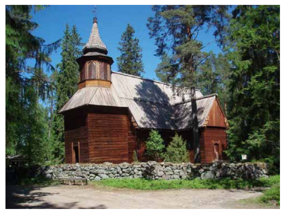
Pihlajavesi Old Church was built in 1780. The atmospheric Church rose to the lap of the forest with the help of a small number of parishioners.

The Church is a symmetrical cross church in shape. The length of both cross arms is about 17 meters and the width is about 7 meters. The construction technique was traditional. The walls were built with horizonal corner joints, whereas the ceiling has a vaulted board structure. The roof structures have decorative paintings made with red ochre paint. They were probably painted about a year after the Church was completed. In other respects, the Church is unpaved in its interior. The outer roof is made of wooden shingles. The Church's