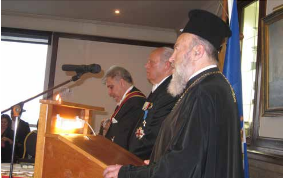
His Em. Petros, during the investiture ceremony of the Hellenic Exarchate in 2010 and 2014.