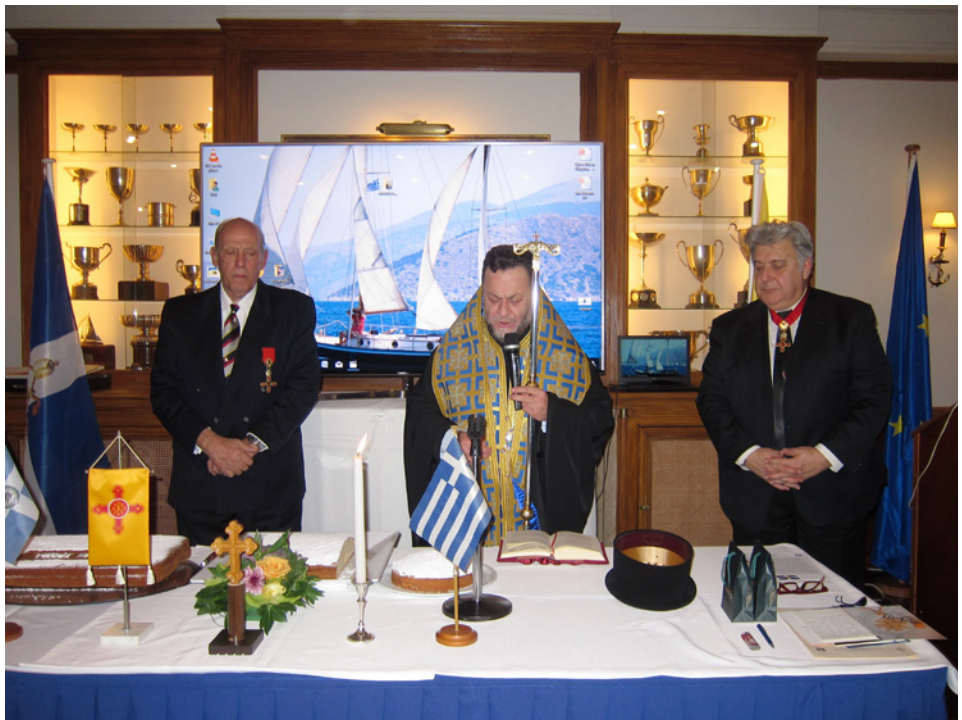
His Eminence, blessing the New Year's Cake ( Vassilopita ) – The Exarche – The Master of ceremonies

Some days ago, fell into my hands the appeal of a Holy Metropolis of Africa.