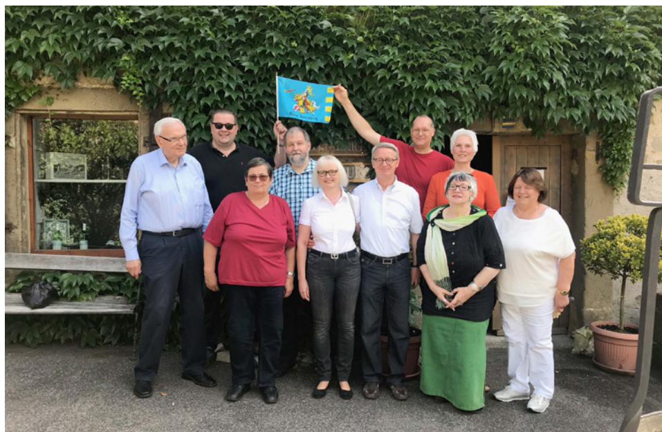
Group photo in front of the winery.