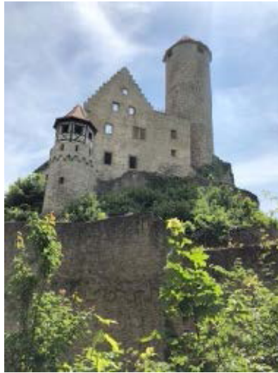
Burg Hornberg (former home of Knight Götz von Berlichingen).