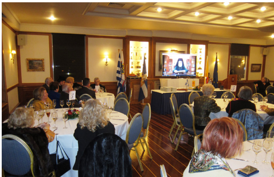
Monitoring of the Christmas message, of His Beatitude Pope and Patriarch of Alexandria, Theodoros II.