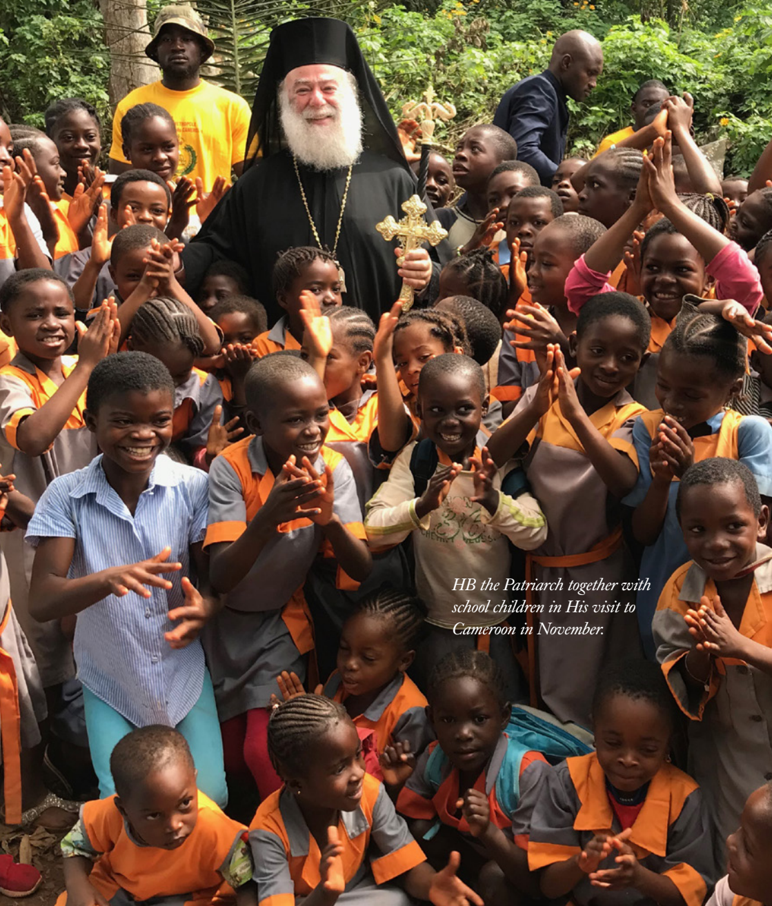
HB the Patriarch together with school children in His visit to Cameroon in November.