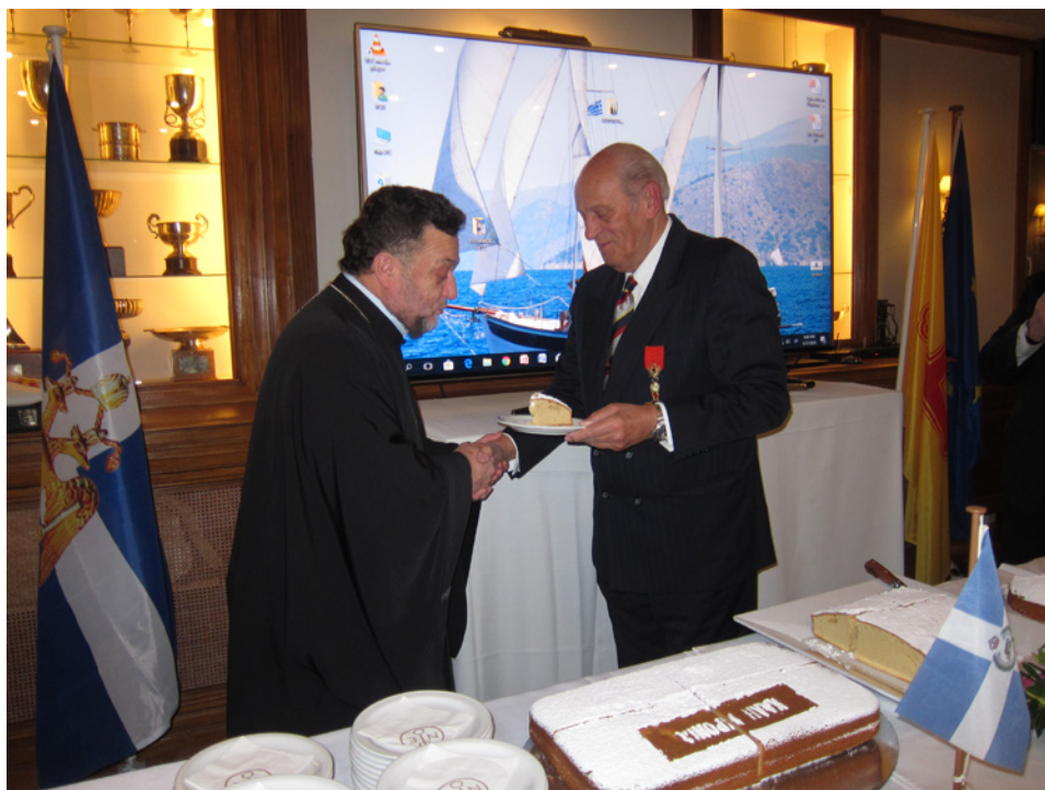
The Exarche giving a piece of "Vassilopita" to His Eminence